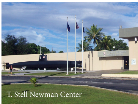
T. Stell Newman Center

To learn more about the park, visit the T. Stell Newman Visitor Center near Naval Base Guam, or call 1 (671) 333-4050 ( www.nps.gov ).