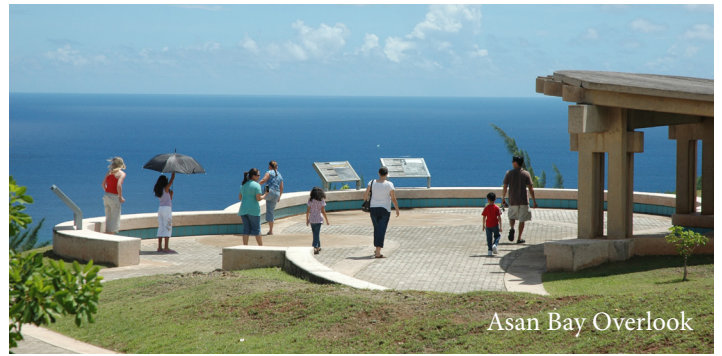
Asan Bay Overlook

South Pacific Memorial Park – To commemorate all those who died on Guam during World War II, a Japanese nonprofit group called the South Pacific Memorial Association Mission funded construction of this memorial, completed in May 1970. Located just off Marine Corps Drive at the foot of Mt. Matagi, it is known as the last Japanese command post. A 50-foot tower shaped like praying hands commemorates 500,000 Japanese lives lost in Micronesia throughout WWII.