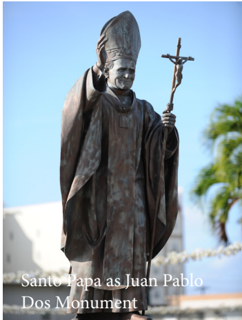
Santo Papa as Juan Pablo Dos Monument

Plaza de España – Home to the governor's palace during the Spanish period, the Plaza de España is a favorite site for visitors. Although most of the palace was destroyed during the retaking of Guam during WWII by U.S. forces, three structures are still standing - the three-arch gate, the Azotea (or back porch) and the Chocolate House.