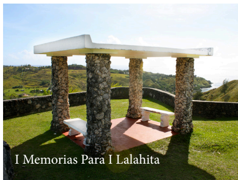
I Memorias Para I Lalahita

I Memorias Para I Lalahita – Dedicated in 1971 to the Guam men who died in Vietnam, this site offers an unmatched view of Guam's southern mountains. A 2-foot wall surrounding the memorial allows you to sit and admire waterfall valleys, mountain ranges, and Umatac village below.