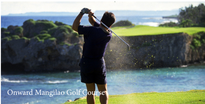
Onward Mangilao Golf Course

Guam has become a tropical destination of choice for travelers from Asia, the United States and even Europe. Despite the rich history of Spanish influence and World War II significance, the attractions lies in adventure for many visitors to our island. With fun and safety at the top of the list, you can find everything from the sky to under the sea to keep your adrenaline running on our island. Explore the activities below to find something that appeases your adventure needs – no matter what your age. Experience paradise – Guam awaits you.