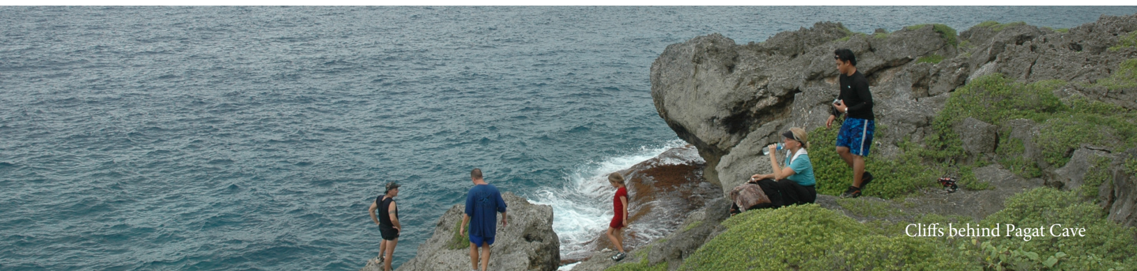
Cliffs behind Pagat Cave

War in the Pacific Historical Park – Comprised of seven different park areas - on land and under the sea - this site honors all who participated in the Pacific Theater of WWII, including those from the United States, Japan, and the Allied nations. Operated by the National Park Service, the site spans 1,000 total acres and hosts thousands of visitors annually.