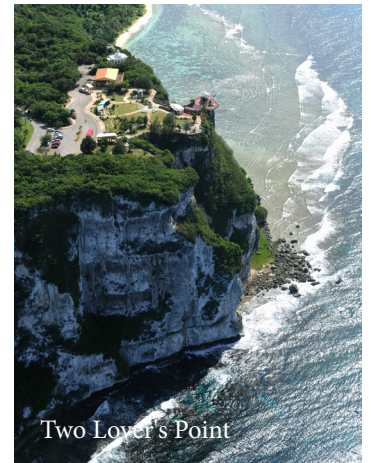
Two Lover's Point

Two Lover’s Point (Puntan Dos Amantes) – A favorite among visitors, Two Lovers Point offers a breathtaking view and a look into the culture and history of the island. According to ancient folklore, two ill-fated lovers who had been forbidden to marry tied their hair together, then leapt to their deaths from this 378-foot-high cliff. The site offers a visitors center open daily and